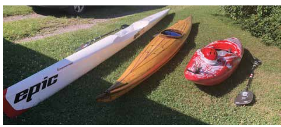
CHOICES: Kayaks come in a wide range of sizes, weight, and materials such as plastic, fiberglass, and carbon fiber. When choosing a kayak, it's important to keep in mind where it will be used and what it will be used for.

First, all the kayaks are dropped off near Hillsgrove, and one person remains to keep an eye on them. The vehicles are driven down to Sandy Bottom and one vehicle takes everybody back to Hillsgrove. This is just one way of doing it. Another way is